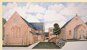
DESIGN DEVELOPMENT DRAWING

LITURGICAL DESIGN CONSULTATION MASTER PLANNING