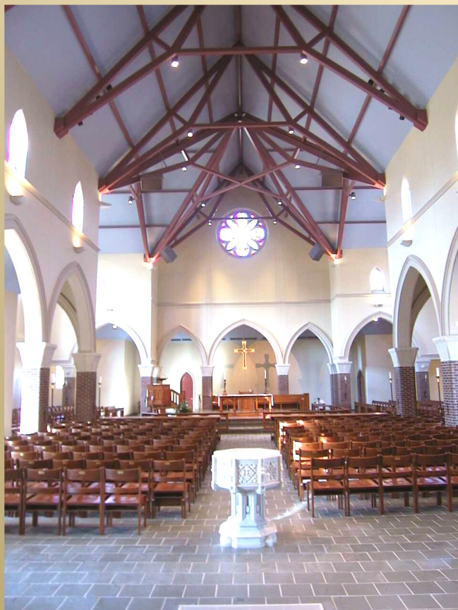
NEW NAVE LOOKING TO THE EAST