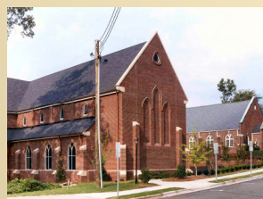
EXTERIOR WITH OLD CHURCH IN BACKGROUND