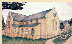
DESIGN DEVELOPMENT DRAWING