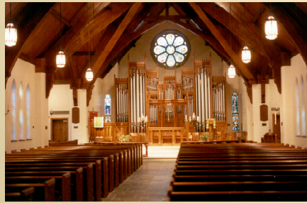
AFTER ADDITION & RENOVATION