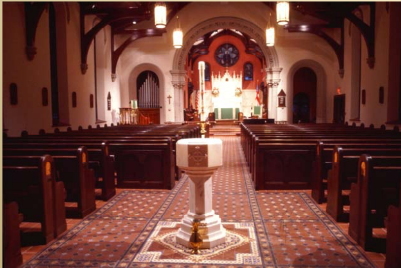
Nave View from Entry

LITURGICAL DESIGN CONSULTATION MASTER PLANNING