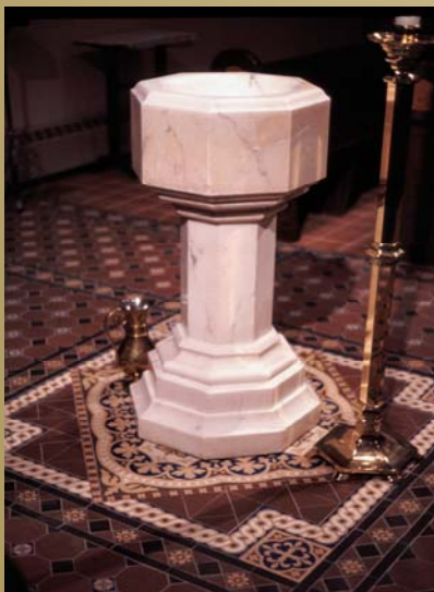
Minton Tile Pattern at Font