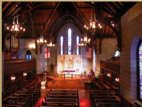
View of Nave & Chancel from Balcony