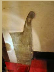
Original Faux Finish Behind Pew End