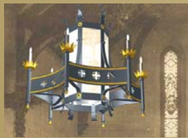
New Light Fixture