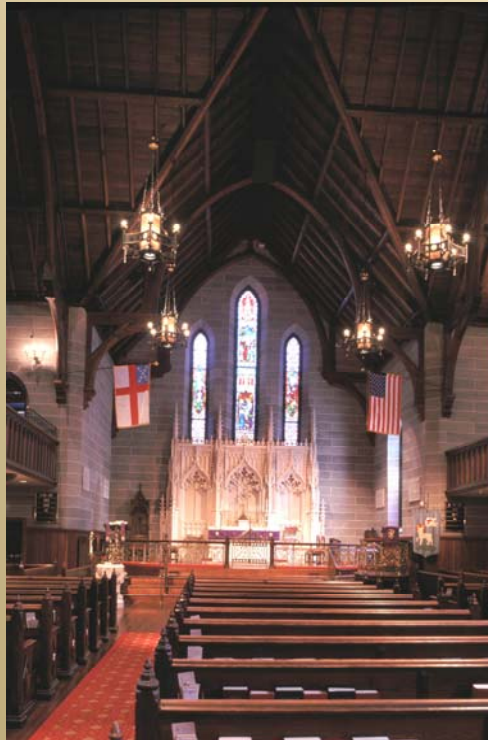
Chancel & Reredos