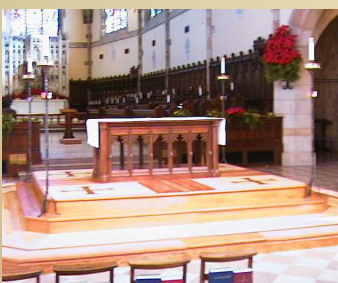
Removable Altar Platform