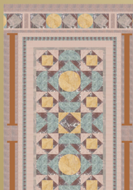
New Chancel Floor Pattern