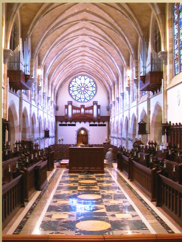
New Inlaid Marble Chancel Floor