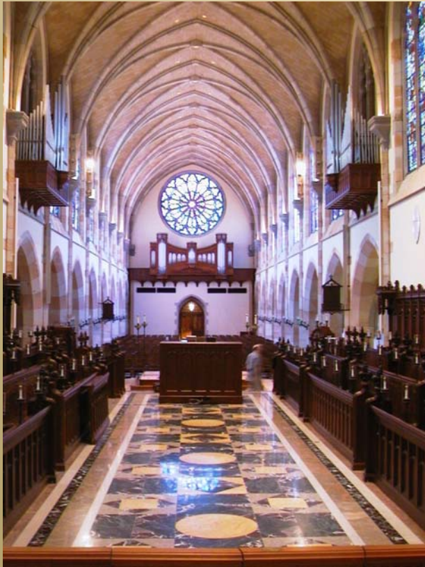
New Inlaid Marble Chancel Floor