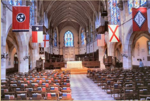
Nave after installation of Altar Platform

LITURGICAL DESIGN CONSULTATION MASTER PLANNING