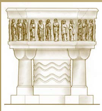
New Baptismal Font