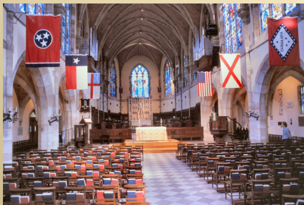
Nave after installation of Altar Platform