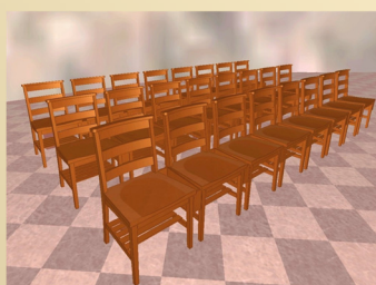
New Chapel Chair Design