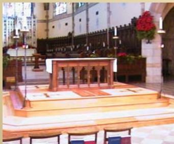
Removable Altar Platform