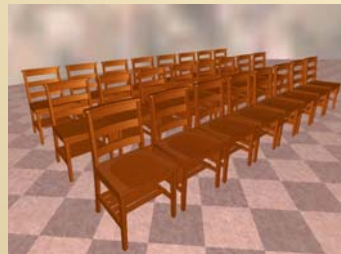
New Chapel Chair Design