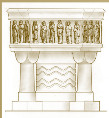
New Baptismal Font