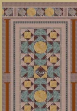
New Chancel Floor Pattern